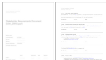
Definition and configuration of customer exports