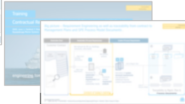
User training and on the job coaching